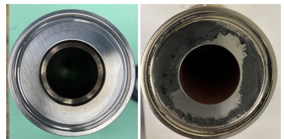
After exposure to 500 SIP cycles: Comparison of stainless steel flanges after removal of EPDM gaskets